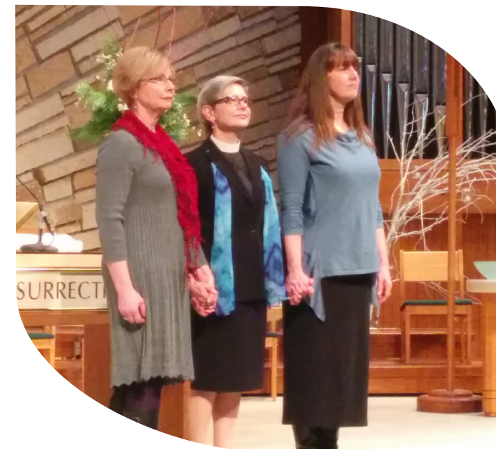
Care Team Commissioning, Dec. 6